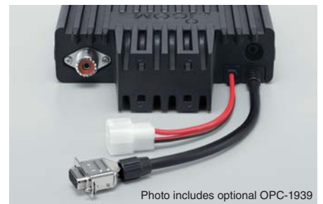
Photo includes optional OPC-1939

With the optional OPC-1939 D-SUB 15-pin ACC cable, the IC-F5026/H series can be programmed to control an operating channel from an external device (up to 16 preprogrammed channels). The ACC connector also provides an ignition sensing function, external PTT, PC command, horn honk, audio output and modulated signal input depending on programming.